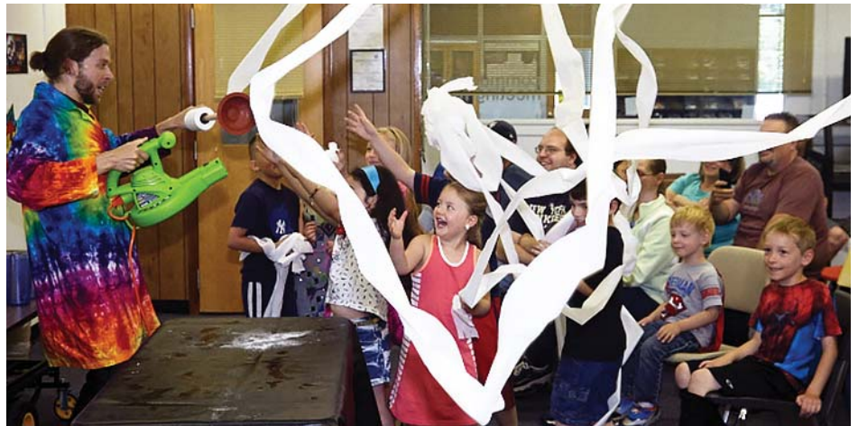
The Sciencetellers bring excitement and audience participation this month with their Building Tall Ships and Pirate Tales program.